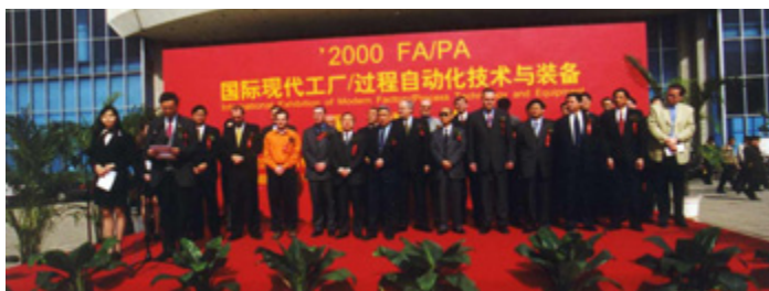
A major step forward came when the Chinese automation market opened up to PROFIBUS technology. Standardization was the key to marketplace acceptance.

The latest region to join the PI community is India. An RPA there is still in formation but the indicators described above are emerging faster than usual. Expect some interesting developments there, particularly on the device front.