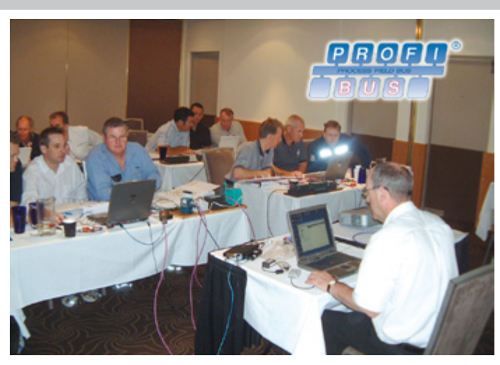
efficiency and reduce manpower.

These two regions have experienced tremendous industrial growth over the past five years. However, companies are struggling to source qualified professionals, tradespeople, engineers and instrument technicians to meet the demand. As a consequence, most new projects are adapting new technologies like PROFIBUS to improve future